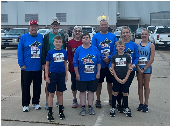
The St. Matthew's Great Land Run team!